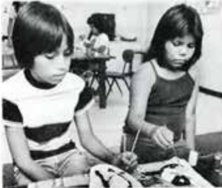
The Daily Oklahoman, Aug. 8

For the second consecutive year, OCCF has made grants for special projects in an effort to be more responsive to community needs. This year's grant recipients were: